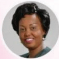
Hon Lydia H. Mizighi, MP

Chairperson, Diaspora Affairs & Migrant Workers Committee Taita Taveta County Women Rep, National Assembly