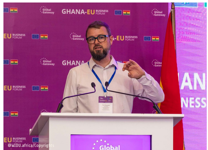
Business Forum in Ghana

largest digital conference, held from 26–28 May. During his talk, "From 'Black Tax' to 'Business Capital' – Transforming African Diaspora Remittances," he highlighted the power of diaspora remittances to drive sustainable economic growth, promote entrepreneurship, and foster innovation in Africa through the support of WIDU.africa's digital platform.