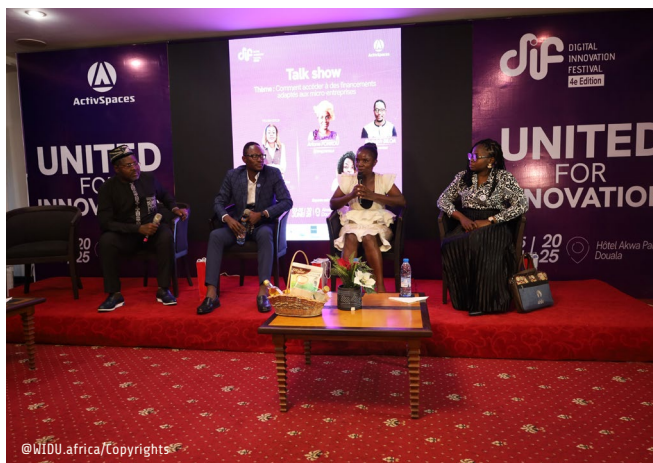
Digital Innovation Festival in Cameroon