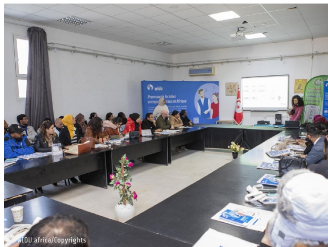
WIDU Networking Sessions – 2nd Edition in central regions of Tunisia

partners, they are working to strengthen the role of the Kenyan diaspora in national development through entrepreneurship, investment, and skills transfer.